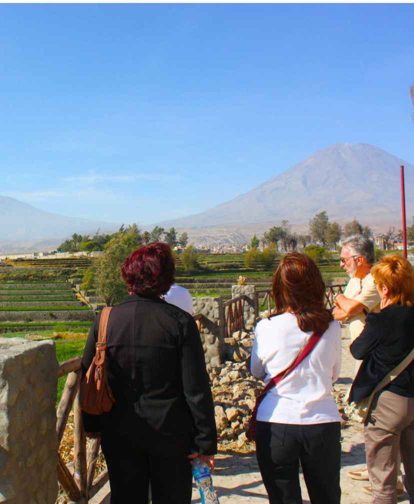
Private Guided Tour Around Arequipa's Countryside