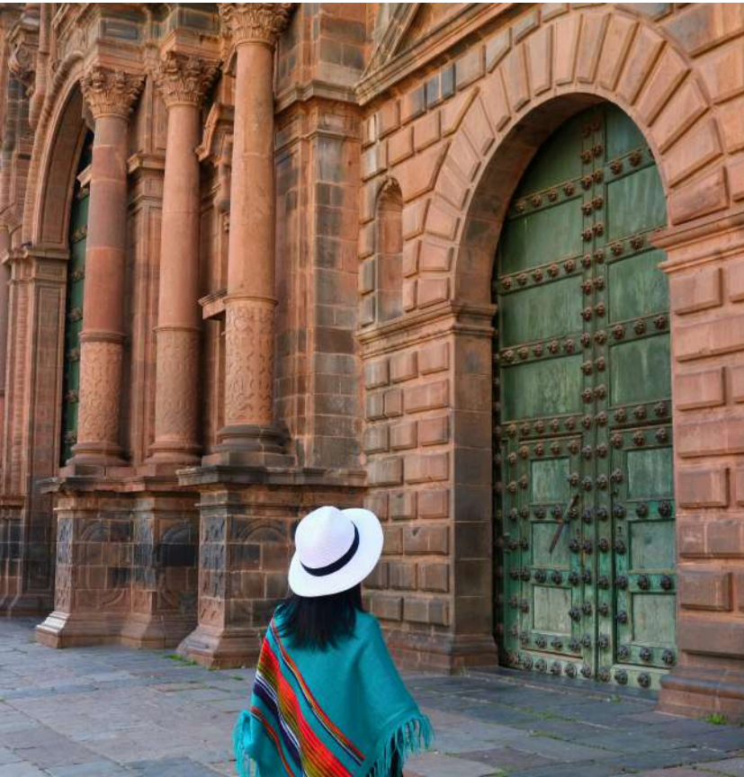
Private Guided Tour at the Historic Center of Cusco