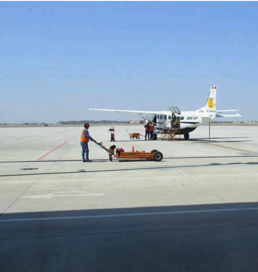
Cessna Caravan - Pisco Airport