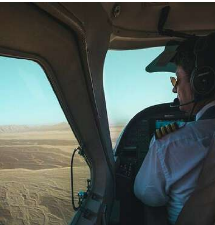
Nazca Lines Flight over the Desert.