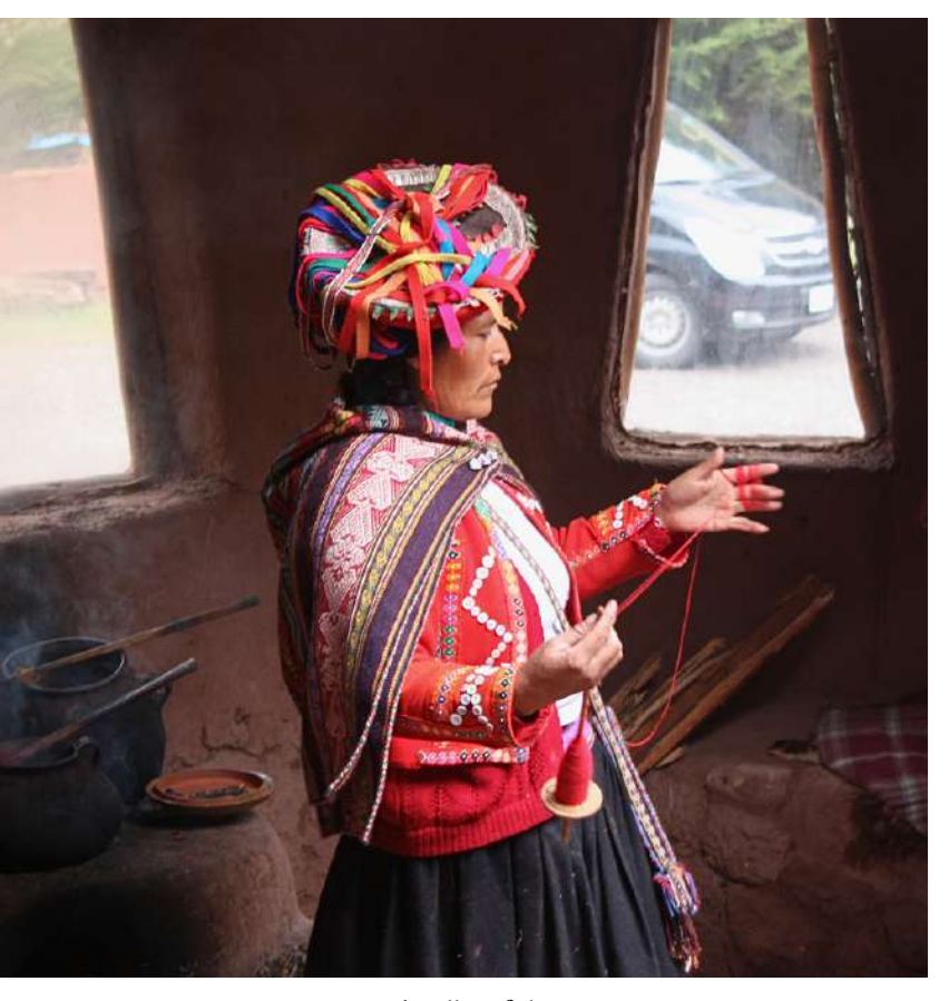
Sacred Valley of the Incas