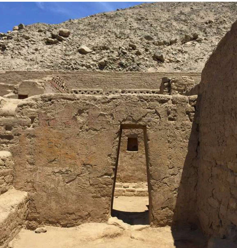
Inca Tambo at the Pisco Valley