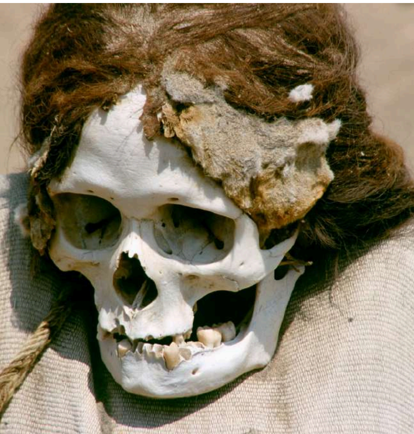
Ancient Mummy of Chauchilla