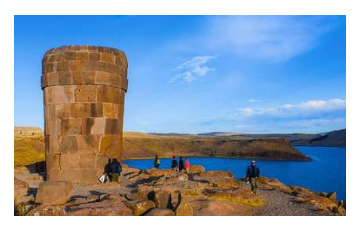
"ENJOY THE PEACEFUL SPLENDOR OF LAKE UMAYO"

The Chullpas at Sillustani stand out with their unique cylindrical shape, a rare architectural style in the Andean region. Unlike typical structures, these ancient towers elegantly taper towards the top, reflecting the advanced skills of the Kolla people. When you visit, you'll be amazed by the precision of the stonework and the innovative design that has stood the test of time. This remarkable site invites you to step back in history and witness the architectural marvels of a bygone era.