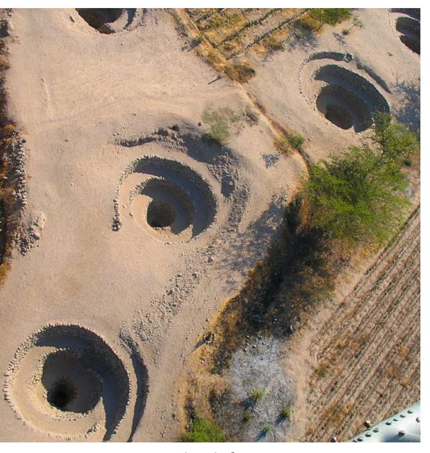
Ancient Channels of Cantayo