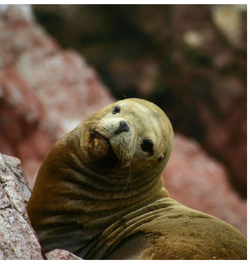
Sea Lion at the Ballestas Islands