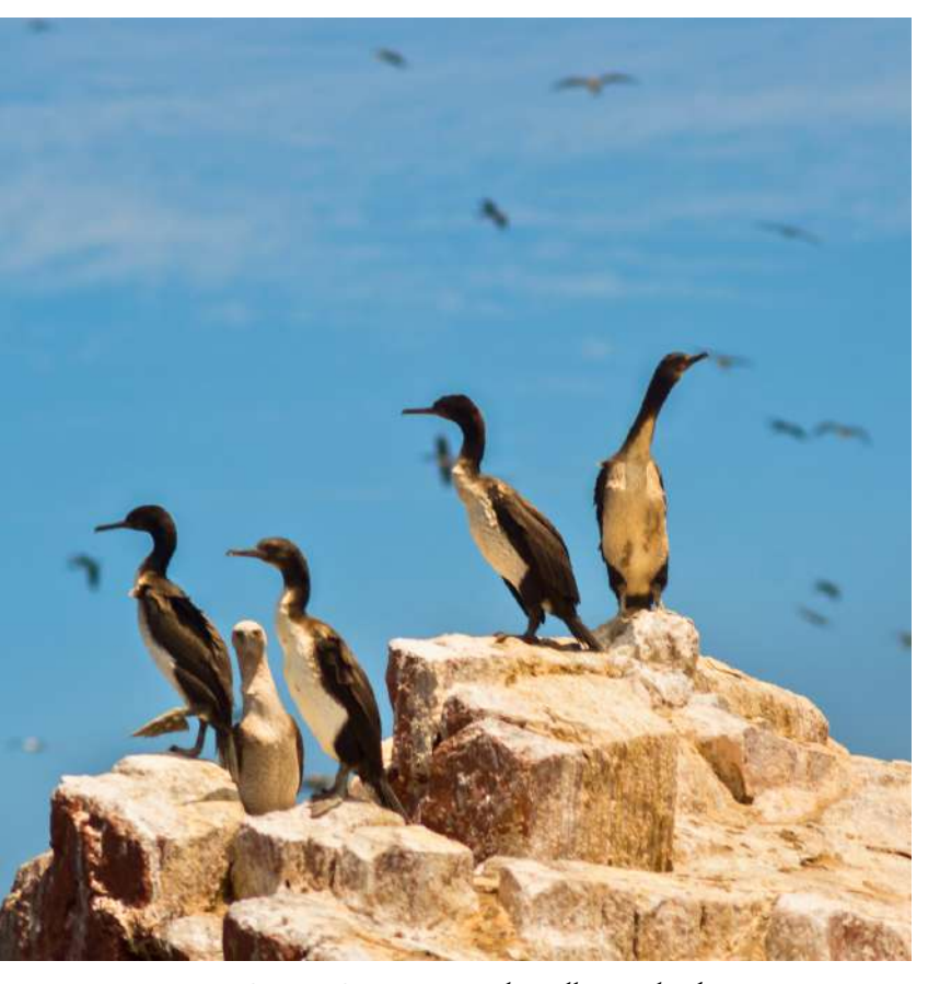
Guanay Cormorants at the Ballestas Islands