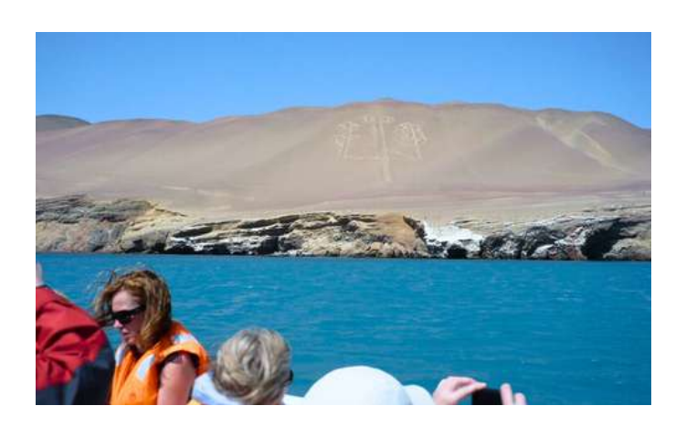
"Encounter Humboldt Penguins Up Close: A Rare and Adorable Wildlife Experience"

As you journey towards the Ballestas Islands, you'll be captivated by the enigmatic Candelabro. This colossal, ancient geoglyph etched into a hillside en route has intrigued historians for centuries. Visible only from the sea, this iconic symbol adds a touch of mystery and excitement, setting the perfect tone for the adventure that awaits at the Ballestas Islands.