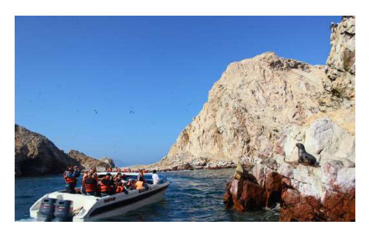
"MEET HUNDREDS OF MARINE BIRDS AND LARGE GROUPS OF SEA LIONS"

Sail through the deep blue waters of the Pacific Ocean as you embark on a journey to the Ballestas Islands. Surrounded by breathtaking coastal landscapes, this boat tour offers the perfect mix of serenity and excitement. The islands, with their rugged beauty and abundant wildlife, provide a picture-perfect backdrop for your adventure at sea.