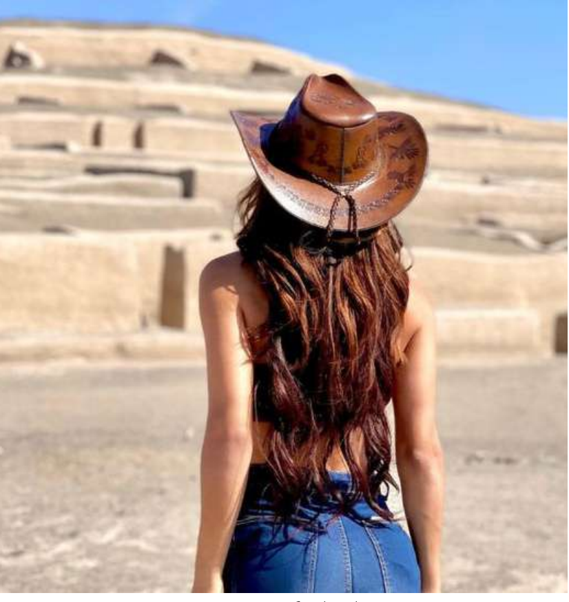
Ruins of Cahuachi