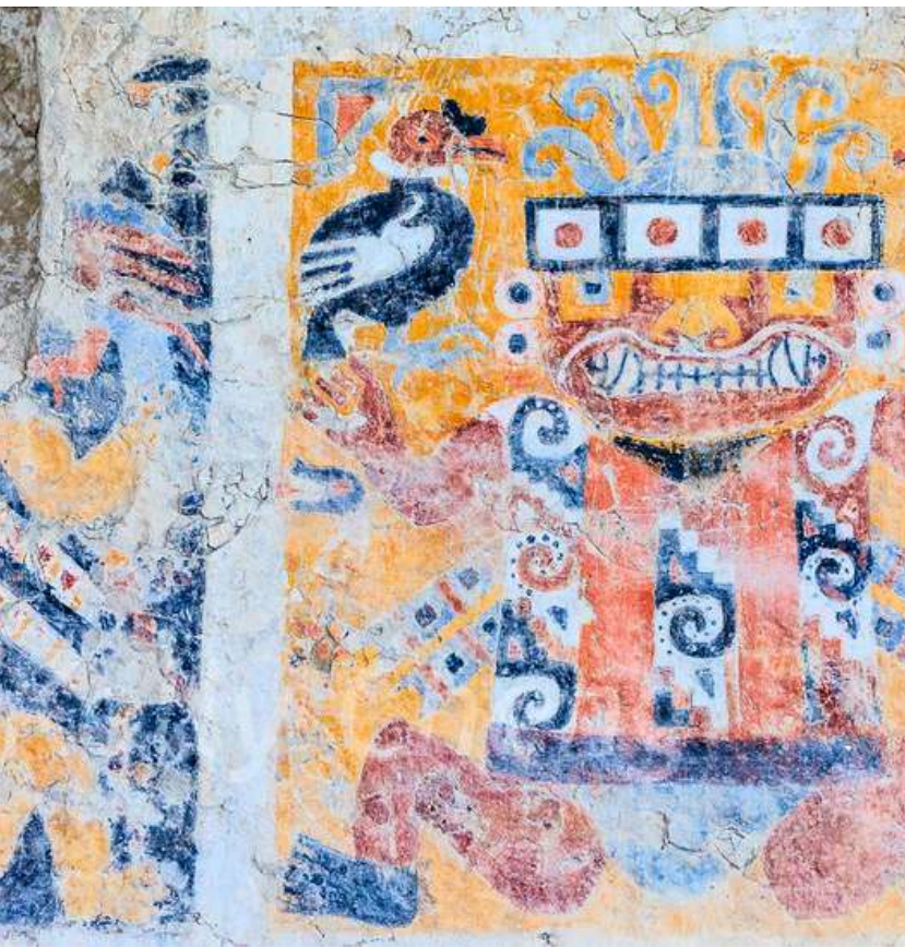
The Brujo Complex