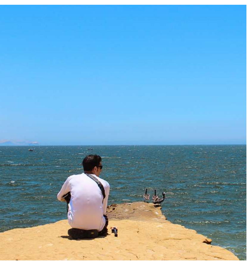
Paracas National Reserve