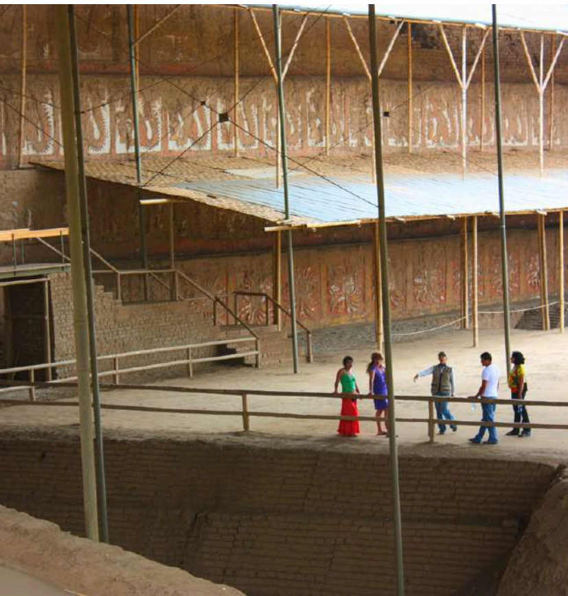
Moche Temple of the Moon