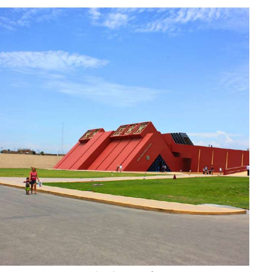
Royal Tombs Museum of Sipan