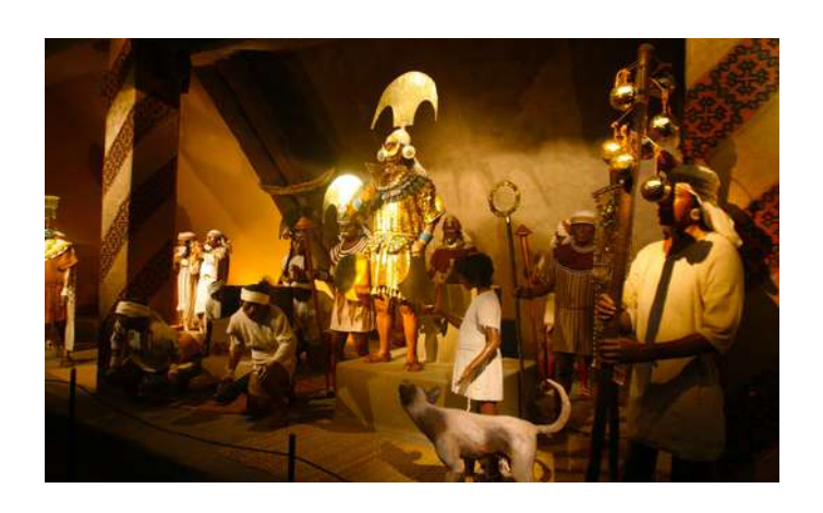
"Uncover the Secrets of Moche Royalty"

Explore the Royal Tombs of Sipán Museum in Lambayeque, home to one of the most impressive collections of Moche gold, jewelry, ceramics, and royal funerary treasures ever discovered in Peru.