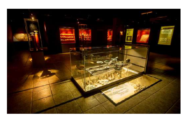
"EDUCATIONAL TOUR WITH LOCAL EXPERTS"

See the exact replica of the famous burial chamber of the Lord of Sipán, considered one of the most important archaeological finds in the Americas for its richness and preservation.