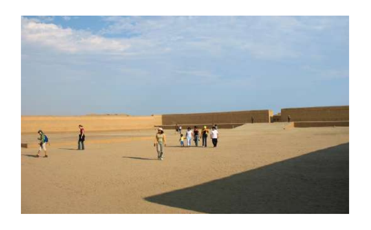
"MARVEL AT INTRICATE ADOBE FRIEZES"

Walk through the vast ceremonial plaza of Chan Chan, where important rituals once took place. Admire high adobe walls adorned with marine friezes that reflect the Chimu's spiritual connection to the sea and natural world.