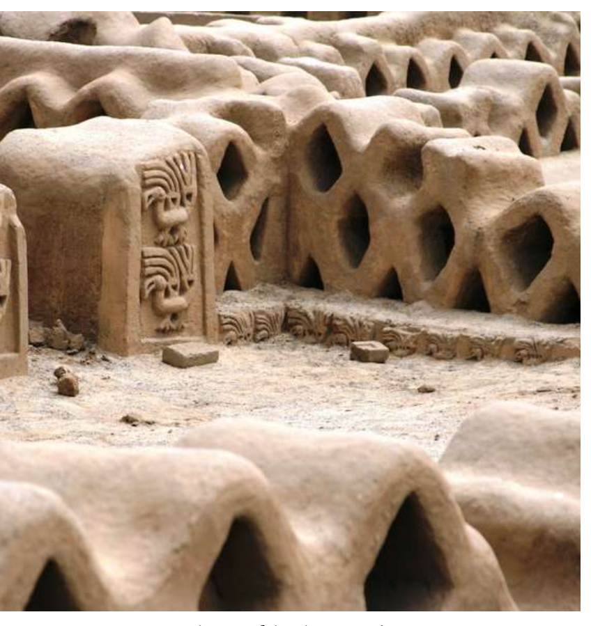
The City of the Chimu Kingdom