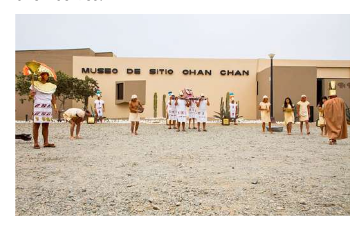
"VISIT THE ROYAL MAUSOLEUMS AND NOBLE QUARTERS"

Begin your Chan Chan Ruins Tour at the excellent site museum. View original artifacts — ceramics, textiles, wood carvings, tools — and a scale model of the ancient city. Gain key insights into Chimu society before exploring the ruins themselves.