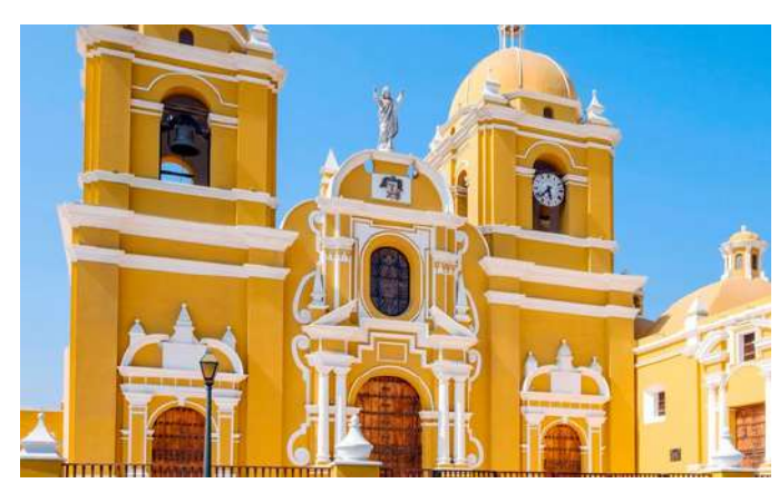
"DIVE INTO NORTHERN PERU'S ANCIENT CIVILIZATIONS"

Stand before the Cathedral of Trujillo, a symbol of religious tradition and baroque architecture. Though we don't enter, your guide will unveil the fascinating history behind its striking yellow towers and centuries-old legacy.