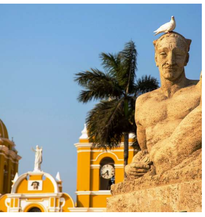
The City of the Trujillo