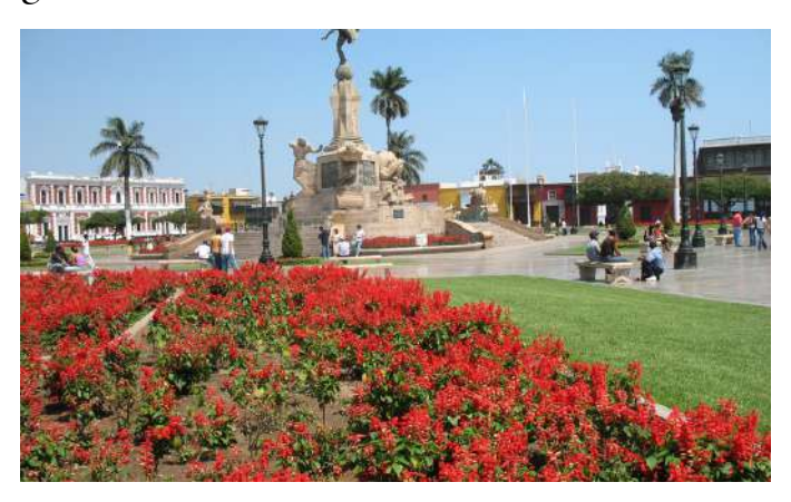
"Visit Casa Urquiaga, a Colonial Jewel"

Begin your journey in the vibrant Plaza de Armas, the heart of colonial Trujillo. Surrounded by colorful mansions and palm trees, this iconic square is rich with stories of independence and grandeur.